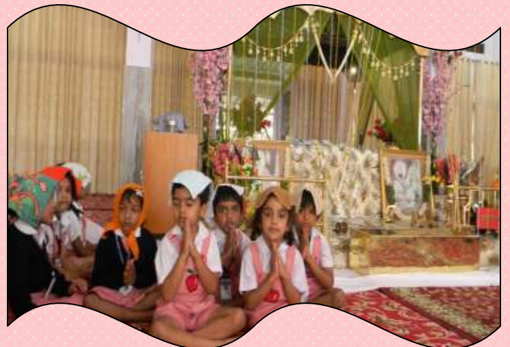
Field trip to Gurudwara