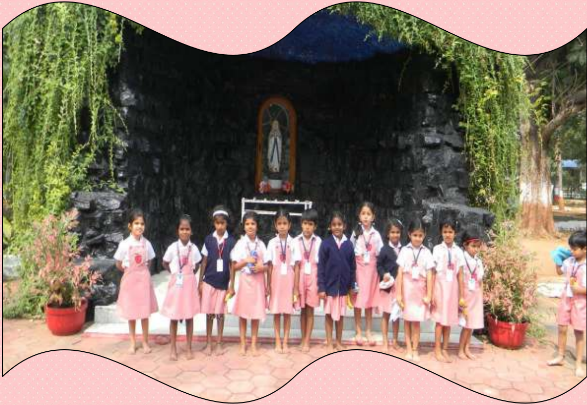
Field trip to Church