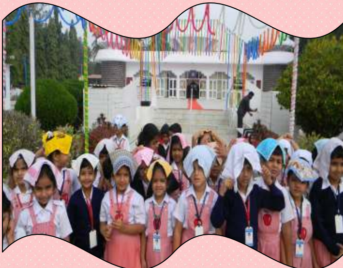
Field trip to Gurudwara