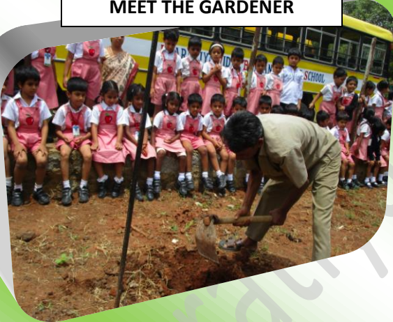
MEET THE GARDENER